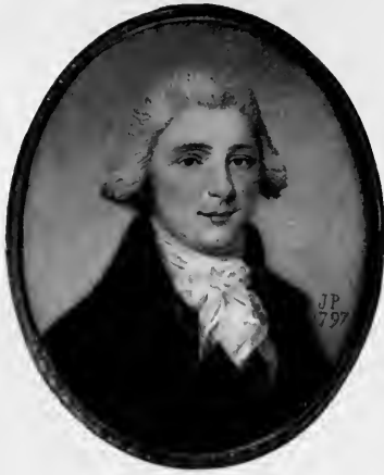
Christopher Greenup By James Peale Page 127